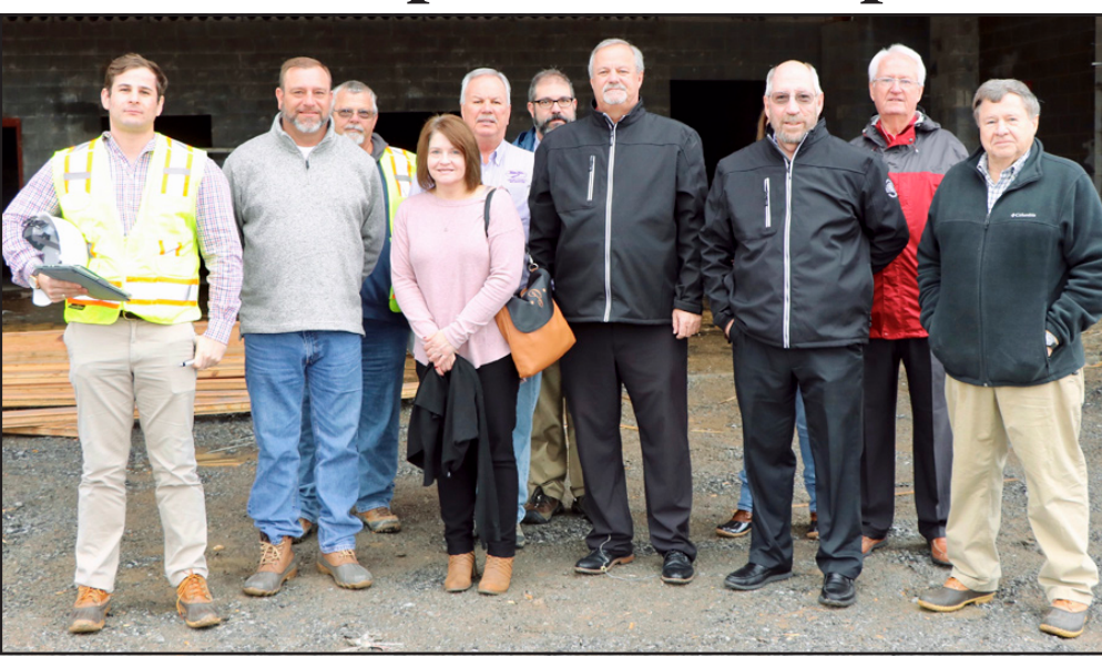
Stakeholders involved in the construction of the new Union County Double Gym held a tour of the unfinished facility last week.