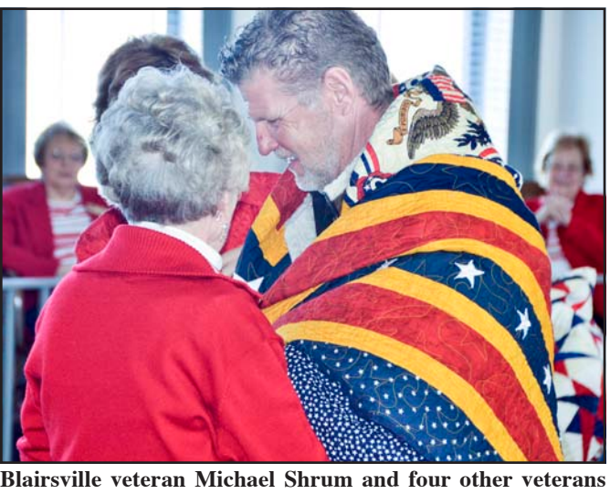
received Quilts of Valor on Saturday, Feb. 22, courtesy the patriotic Misty Mountain Quilters' Guild.